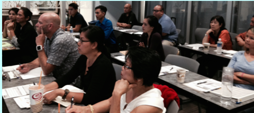
How to Start a Business at Chef Zone

Chef Zone hosted the popular "How to Start a Business" class on April 22, 2015 in their new facility near the airport. Attendees learned what steps to take to get their businesses up and running. Some of the topics addressed included Market Analysis, Business Process, Legal Entity Structure, Capital Investment, and several others essential for starting a business.